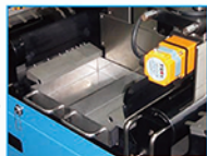
完成品收料盒 Finished Parts Hopper