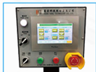
操控箱 Operating Elements