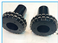
載料滾筒 Bearing Drum