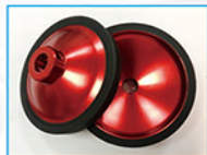
盤型橡膠輪 Fitting The Rubber Wheel